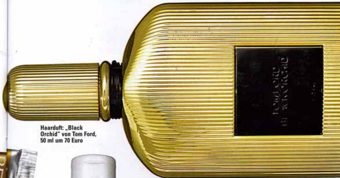
Haarduft: „Black Orchid“ von Tom Ford, 50 ml um 70 Euro