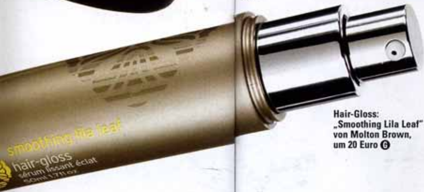
Hair-Gloss: „Smoothing Lila Leaf“ von Molton Brown, um 20 Euro