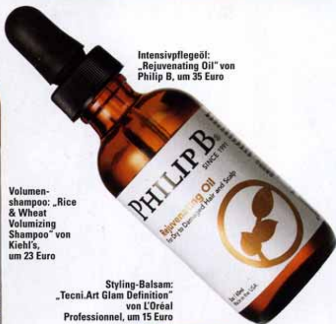
Intensivpflegeöl: „Rejuvenating Oil“ von Philip B, um 35 Euro