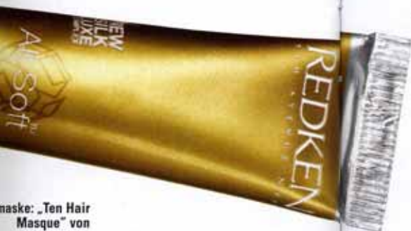
maske: „Ten Hair Masque“ von Alterna, um 70 Euro