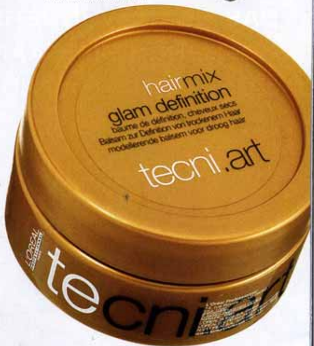
Styling-Balsam: „Tecni.Art Glam Definition“ von L'Oréal Professionnel, um 15 Euro

hairmix glam definition Baume de définition, cheveux secs Balsam zur Definition von trockenem Haar modellierende balsam voor droog haar tecni.art